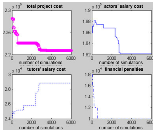
Figure 2 : Financial viewpoint

By using the simulated annealing based algorithm, the total cost obtained by the partial optimization of the k sub-problems has been decreased about 3%. The variation of the total cost is presented by the first graph in Figure 2, and the variation of three sub-costs is presented by the other graphs. Concerning the financial penalty, we found that, before task assignment ( k=0 ), 9 competent actors were missing. At the end of the horizon, the number of competent actors was increased and only 5 competent actors were still missing.