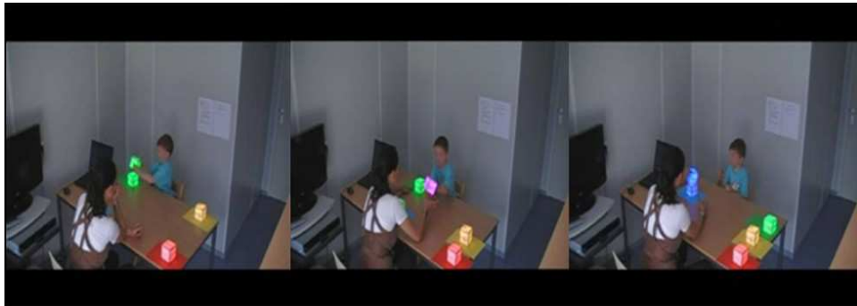
Fig.2. Snapshots of performing scenario 3. a) Child shares block (cooperates) b) Coordinator colors 2 nd block after the second turn taking.

The scenario ends after the coordinator colored his or her second block.