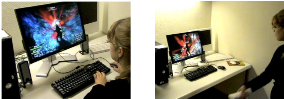
Fig. 2. Playing Wii Remote Dungeon Quest in the Standard Interaction condition using keyboard and mouse ( left ). Using the Wii-Remote ® control in the Gesture condition ( right ) to perform striking movements causes corresponding hits performed by the in-game character.

Up to two participants were tested at the same time. By drawing a slip of paper they assigned themselves either to the Gesture condition or the Standard Interaction condition. They were then told that they would participate in testing a novel game. Neither the violent nature of the game, nor our interest in its effects was mentioned.