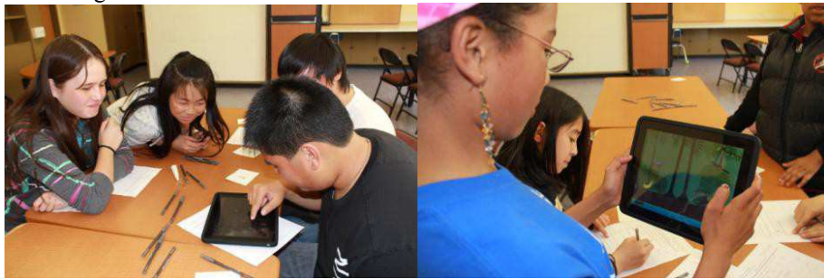
Fig. 4. Photographs from playtesting session at school.

User testing was conducted at a school on 50 students ranging from fourth to eight grade. Students were brought in groups of five and each played a different game on the iPad (see Fig. 4). 72% of the students said they would be interested in redeeming their points online. They also had the opportunity to write a fact that they learned from the game. 67% of students that played the camouflage game (n=12) were able to state a fact that they learned from the game. Example responses to this prompt for all the games include “I learned to make your penguin black or it will be eaten by a shark,” “the bird is the enemy of the butterfly,” and “animals, such as lizards, camouflage themselves.”