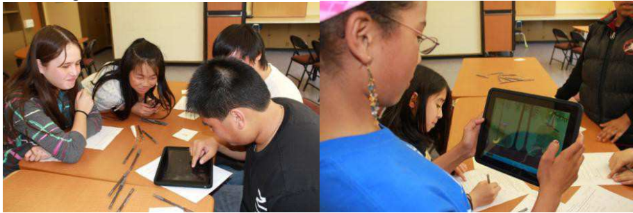
Fig. 4. Photographs from playtesting session at school.

User testing was conducted at a school on 50 students ranging from fourth to eight grade. Students were brought in groups of five and each played a different game on the iPad (see Fig. 4). 72% of the students said they would be interested in redeeming their points online. They also had the opportunity to write a fact that they learned from the game. 67% of students that played the camouflage game (n=12) were able to state a fact that they learned from the game. Example responses to this prompt for all the games include “I learned to make your penguin black or it will be eaten by a shark,” “the bird is the enemy of the butterfly,” and “animals, such as lizards, camouflage themselves.”