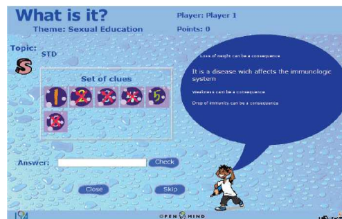
Figure 1: Student interface to the What Is it? sex education game.

We illustrate the potential of our approach by adding cultural support to a sex education quiz game called, What is it? The student's interface is shown in Figure 1. What is it? is a web quiz game where the player sees a topic with an associated secret word. Their task is to guess the word based on a series of clues that are shown one at a time. The objective is to guess the word after seeing the least number of clues. There are ten clues that can be selected by the learners by clicking on a number. The challenge for the teacher is to make a set of secret words and clues that are related to the students' concepts and vocabulary, otherwise, they will be alienated from the concepts being described. For example, many sex education curricula are