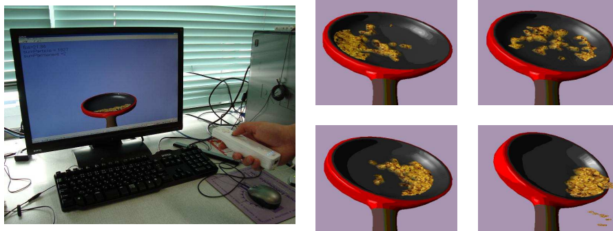
Fig. 4. System Appearance

The experiment was constructed on a system with a WiiRemote using a Intel Core 2 Duo E6300 1.86GHz CPU, 1024MB RAM. In this system, the GIB is supposed as fried rice (not traditional Chinese fried rice but Japanese) and the container as a skillet (Fig.4). Through this system, subjects were able to move fried rice by moving the container. 8 subjects evaluated the GIB movement's realism by classifying the score into seven grades. 1st grade is "This model doesn't feel real enough for a cooking system". 7th grade is "It is as natural as a real one". 3 subjects evaluated it as 4. 4 subjects evaluated it as 5. One subject evaluated it as 6. The results of the performance test is shown in the Table 1. We got some positive evaluations such as that GIB movement seems natural with 331 vertices and 670 particles. Good results were obtained but there are some points that need improvement. We have to improve upward movement of the GIB without the particle system. We are also developing a model for using cooking tools e.g. a spatula in this model.