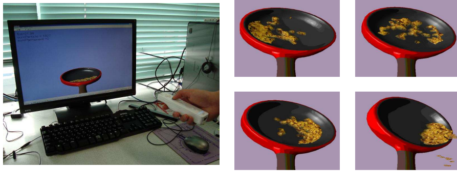
Fig. 4. System Appearance

The experiment was constructed on a system with a WiiRemote using a Intel Core 2 Duo E6300 1.86GHz CPU, 1024MB RAM. In this system, the GIB is supposed as fried rice (not traditional Chinese fried rice but Japanese) and the container as a skillet (Fig.4). Through this system, subjects were able to move fried rice by moving the container. 8 subjects evaluated the GIB movement's realism by classifying the score into seven grades. 1st grade is "This model doesn't feel real enough for a cooking system". 7th grade is "It is as natural as a real one". 3 subjects evaluated it as 4. 4 subjects evaluated it as 5. One subject evaluated it as 6. The results of the performance test is shown in the Table 1. We got some positive evaluations such as that GIB movement seems natural with 331 vertices and 670 particles. Good results were obtained but there are some points that need improvement. We have to improve upward movement of the GIB without the particle system. We are also developing a model for using cooking tools e.g. a spatula in this model.