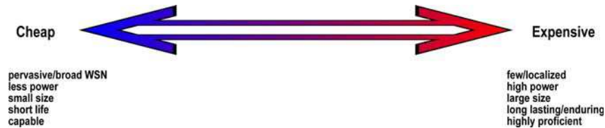
Fig. 1. The cost spectrum for SN systems

points vertically between the surface and the bottom of the water body. This makes the cost of the sensors extremely important in order to take the most measurements.