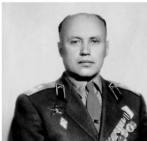
Fig. 1. Colonel Anatoly Kitov, scientific head of Computer Centre № 1 of the USSR Ministry of Defense (1959).

programmers, 85 information analysts, 40 mathematicians (specialists in mathematical modeling), several hundreds specialists in computer engineering worked on specialized and universal computer projects.