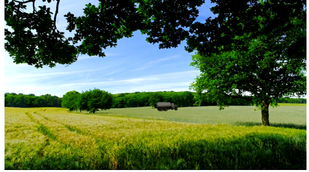
(b) Variant #2 of video sequence