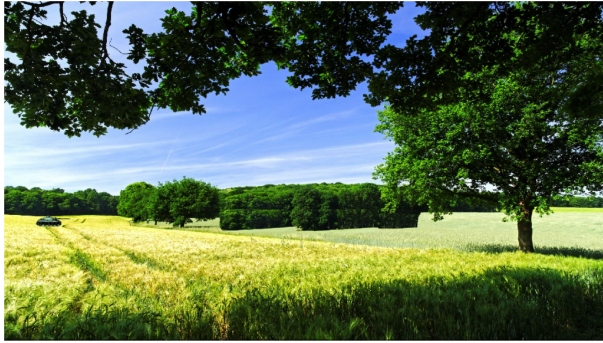
(c) Variant #3 of video sequence