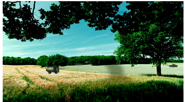
(f) Variant #6 of video sequence