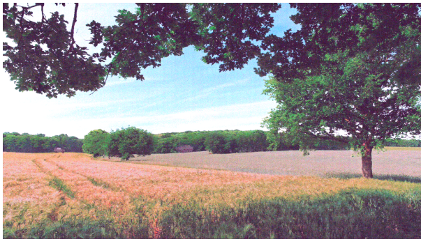
(e) Variant #5 of video sequence