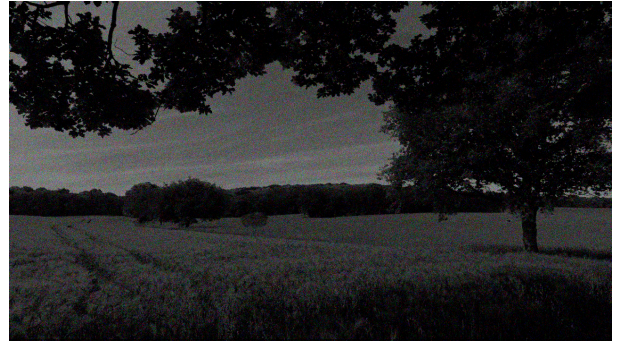
(d) Variant #4 of video sequence