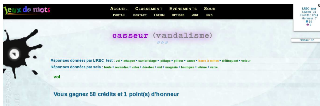
Figure 2: JeuxDeMots: recap of a game involving “casseur” (hooligan).

A galaxy of pseudo games (the definition is given in section 2.2.) were created around JeuxDeMots, including mainly LikeIt 1 , AskIt 2 or ColorIt 3 , that add information to the network. SexIt is one of them.