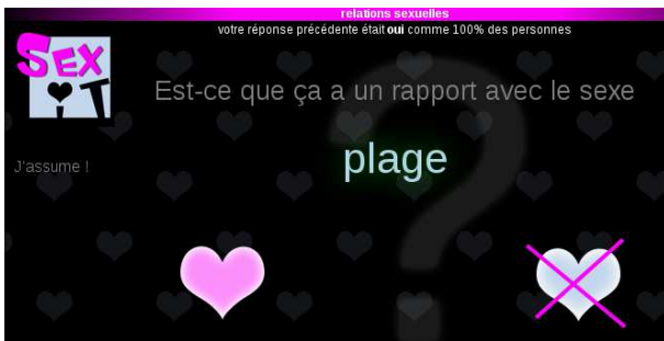
Figure 3: SexIt: is “beach” ( plage ) related to sex?

SexIt 5 allows players to identify a term as being related to sex or not (see an example in figure 3, for “beach”). It is a pseudo game : there is no score, no ranking, no gain, only a poll-like comparison with other players. It is played only because the topic is fun: we would have had more difficulties collecting data on taxation, for example. This is an important limitation for language resource building using that kind of interaction. Collecting information about vocabulary related to sex can be necessary, for example to detect pornographic contents. However, such information is insufficient for discriminating pornography from courses in biology, reproduction or anatomy which, while not being pornographic, contain their share of sex-related terms.