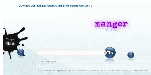
Figure 1: JeuxDeMots: give ideas associated with “manger” (to eat).

The principle behind JeuxDeMots is quite straightforward: players are asked to enter ideas associated with a term chosen by the system (see figure 1). Players get points if they have answers in common with other players. The more original the answer, the more points are rewarded, but the higher the risk of having no intersection at all with others.