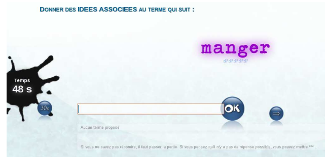
Figure 1: JeuxDeMots: give ideas associated with “manger” (to eat).

The principle behind JeuxDeMots is quite straightforward: players are asked to enter ideas associated with a term chosen by the system (see figure 1). Players get points if they have answers in common with other players. The more original the answer, the more points are rewarded, but the higher the risk of having no intersection at all with others.