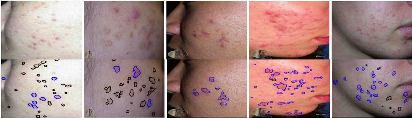
Fig. 3 Acne segmentation of five acne images from a public database [9]. First row: original images with highlight or shading/shadows due to scene geometry. Second row: segmentation results using the MRF model and chromophore descriptors. Inflammatory acne is outlined by the blue line, and hyperpigmentation is outlined by the black line.

Professional evaluation of the derived segmentation results is currently under process by an experienced dermatologist from a hospital (CHU Nice). Based on expert assessment, segmentation accuracy by the proposed method will be quantitatively evaluated in the future.