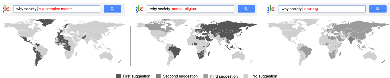
Figure 1. The three most popular suggestions on Google Search for the query “Why society” represented on a world map (suggestions in red).

Samuel Huron INRIA, IRI, Fabelier Paris, France samuel.huron@cybunk.com