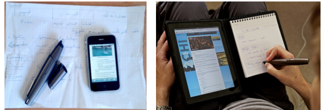
Figure 2: The annotation space can have various forms such as spare sheets (left) or a dedicated notebook (right).

S-Notebook allows the user to link a browsing space with an note-taking space (Figure 2). The former is a browser application, called "S-Browser", that runs on a mobile device while the latter consists of Anoto paper. Both spaces can be manipulated independently so that the user can browse the document and annotate it in parallel. The "S-Browser" can handle various kinds of documents and files, such as Web pages and video files. It provides the capability to create user-defined anchors at arbitrary locations in the browsed file, creating a link between strokes on paper and meta-data of the file. The way these anchors are specified by the user will be detailed in section 4.