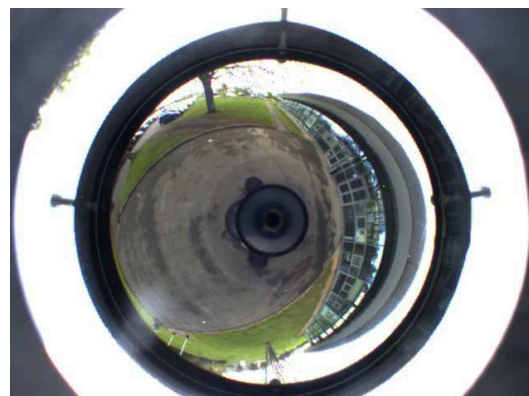
Figure 3: image provided by the Catadioptric system.

For the first projection, the mathematical formulation of the problem consists in mapping all the space directions onto a plane. Mapping one direction of the 3D space is equivalent to map a point from a unit sphere onto a plane [10]. This mapping problem (and its inverse problem) has been widely studied by mathematicians and cartographers [11]. We use the plate carrée cylindrical projection [11] (aka. the equirectangular projection) that is widely used both in cartography and panoramic imaging. Although the plate carrée projection generates some distortions at poles, it preserves the shapes along the 0° parallel. This is known