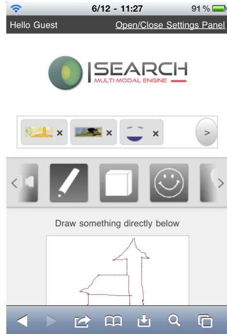
(a) Multimodal query consisting of geolocation , video , emotion , and sketch (in progress).