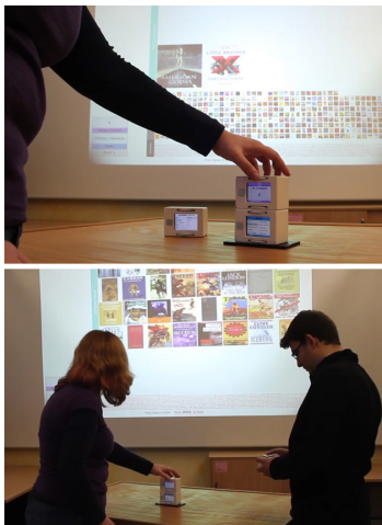
Figure 2: Stackables are small tangibles for faceted browsing that can be used alone or together with others.

Tokens Facet tokens as the main building blocks are stacked (cf. [3]) to form queries. A token can represent any numeric or categorical facet in our dataset and can be assigned and re-assigned on the fly. Thus, each Stackable is generic and contains information about all facets and their values. All tokens share a similar abstract box shape that can be easily stacked. The token's box is held in a neutral white to further emphasize its versatility in facet choice (R1). Facet type is not encoded permanently on the box to allow for reuse. Instead, a color-display on the front shows facet data. Two turnable wheels at the top and bottom (accessible from the front and the back) allow for selection of facets and facet values. The display and wheels are positioned off-center so that the up-direction of a token is readily visible. This also gives room for a button-like area on the left, e.g. used for selection (see Fig. 3).