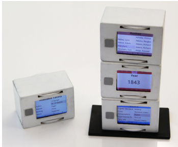
Figure 1: Three Stackables combined in a query stack.

in the selection process. Faceted browsing can help decision makers: they can consider data from different conceptual dimensions and incrementally refine a dataset by restricting facet values such as price, technical attributes, or ratings (e. g., [4, 7]).