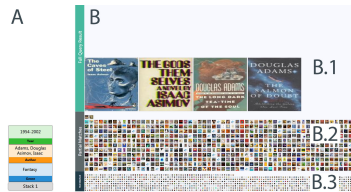
Figure 5: Result representation of a query with three Stackables in a single stack (A). B.1 shows the cover of all books matching all selected facets values in the stack, B.2 shows partial matches, and B.3 all books matching no selected facet value.