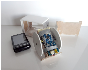
Figure 6: Assembly of the components of Stackables in a wooden box.

by the participating Stackables (Fig. 5, A) and a representation of the results of the queries (Fig. 5, B). The result representation shows three categories of results (B.1-B.3): perfect matches which satisfy all participating queries (all formed stacks), result showing partial matches (items matched by only some stacks or parts of a stack), and all unmatched items. While participating users interact with the tangibles and reorder the stacks, the visualization updates immediately to show new results and near matches. This behavior allows people to actively explore a dataset and adjust queries on the fly.