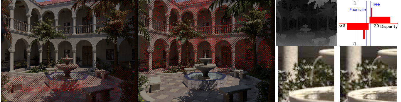
Fig 1: From left to right: 1. Output for left image. Red zebra area (e.g. the fountain) is less focused than in the other image. 2. Output for right image. 3. Left-Right disparity map. 4. Optimized focus difference curve. 5. Left image detail: flowers in focus, fountain out of focus. 6. Right image detail: flowers out of focus, fountain in focus.

Inria Grenoble - Rhône Alpes, France, sergi.pujades@inrialpes.fr