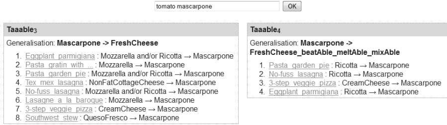
Fig. 3. TAAABLE 3 and TAAABLE 4 's answers to Q = \text{Tomato} \wedge \text{Mascarpone} .

The substitutions proposed by TAAABLE 3 are more various than the ones proposed by TAAABLE 4 . With TAAABLE 4 , mascarpone is substituted for ricotta or cream cheese, while TAAABLE 3 additionally proposes to substitute mascarpone for mozzarella, non-fat cottage cheese or queso fresco. And the larger the set of substituting ingredients, the more likely the adaptation is to fail, because there is less similarity between the ingredients.