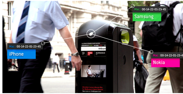
Figure 1.1: Wi-Fi bins by Renew were displaying targeted advertisements in the streets of London. Using a Wi-Fi sniffer collecting the identifiers of nearby phones, the system was able to build a profile of pedestrians and to display advertisement messages on a screen mounted on the side of the bin. These bins have been removed following a complaint by the City of London ( https://www.bbc.com/news/technology-23665490 ).