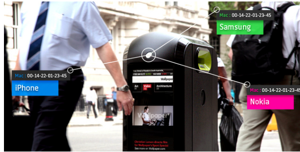
Figure 1.1: Wi-Fi bins by Renew were displaying targeted advertisements in the streets of London. Using a Wi-Fi sniffer collecting the identifiers of nearby phones, the system was able to build a profile of pedestrians and to display advertisement messages on a screen mounted on the side of the bin. These bins have been removed following a complaint by the City of London ( https://www.bbc.com/news/technology-23665490 ).