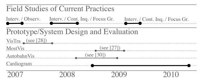
Figure 1: Overview of our development process. Black lines indicate work reported on here. Gray lines indicate phases reported on earlier.

In the following, we describe the various methods we used for studying current practices for introducing VA in our domain. We also briefly reflect on our objectives and experience using these methods for InfoVis/VA in a large company setting in order to provide other researchers with guidance for such undertakings; for a detailed description of our experience with specific evaluation requirements in large company settings we refer the reader to [29]. Our study is among one of the first in-depth endeavors of studying the complex pattern of data analysis using long-term MILCs. The time investment of three years was substantial but essential to our success later. Figure 1 provides a temporal overview of our studies as well as the different participatory tool design and evaluation phases in which we closely cooperated with our target users.