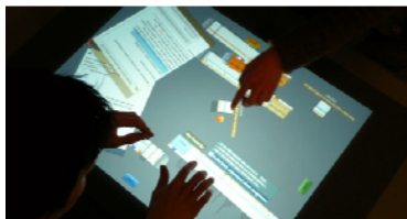
Two uses of Cambiera in practice. Above, a complex tabletop with several tabs and documents organized on the side of the screen. Below, two documents are open on the left side.