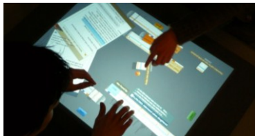
Two uses of Cambiera in practice. Above, a complex tabletop with several tabs and documents organized on the side of the screen. Below, two documents are open on the left side.