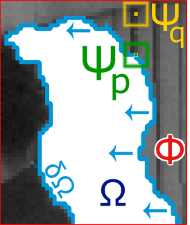
Fig. 1 . Illustration of principle. On (a) a warped view, (b) a zoom on the disoccluded area behind the person on the right, with the different elements overlaid.

Based on this a priori knowledge, we propose a depth-based image completion method for view synthesis based on robust structure propagation. In the following, D(p) is described.