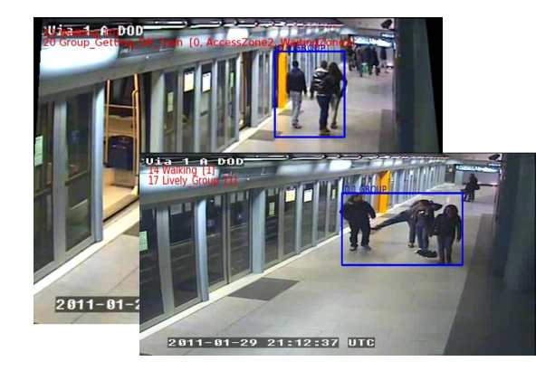
Fig. 4. Example of detected groups and events: a group getting off the train (above) and a group having a lively behavior (below).

groups. Table 1 compares results using two methods for detecting people in the video. The segmentation method (S) uses background subtraction and blob detection. Persons are detected by merging blobs of pixels. The HD method uses the human detector described section 2.1. One can notice that the human detector has less true positives. This is due to the fact that this method only detects persons entirely visible in the view. In case of sequence 3, this method also detects less false positives, it is more accurate in certain cases. As future work, we will combine both methods to detect people and use sensor fusion to merge both results.