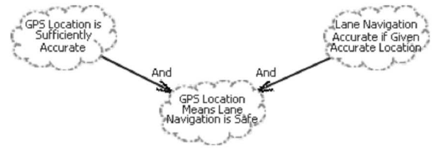
Figure 2: Simple Claim Refinement Model

in a claim refinement model. The refinement model for the example is depicted in Figure 2.