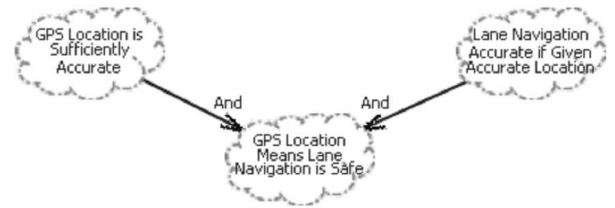
Figure 2: Simple Claim Refinement Model

in a claim refinement model. The refinement model for the example is depicted in Figure 2.