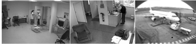
Fig. 2. Two health care and one airport activities monitoring applications.