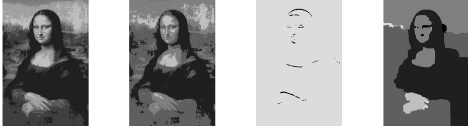
Figure 4. An example of image digitalization in 8 grey levels, with edges enforced, in the same spirit as in Figure 3. We consider 8 classes of grey levels. The individual potentials rely on the intensity of pixels. The coherency criterion makes use of an edge detector and enforces label variations on edges. From left to right : most probable grey level (at each pixel independently) of the original potentials; of the potentials once projected on the set of admissible potentials ( i.e. on \mathcal{F}_0 ); edges enforced; result. It is possible to let the user interact with the process and add edges manually to obtain new digitalization results. The interaction matrices used are (a) and (b) in Table 1.