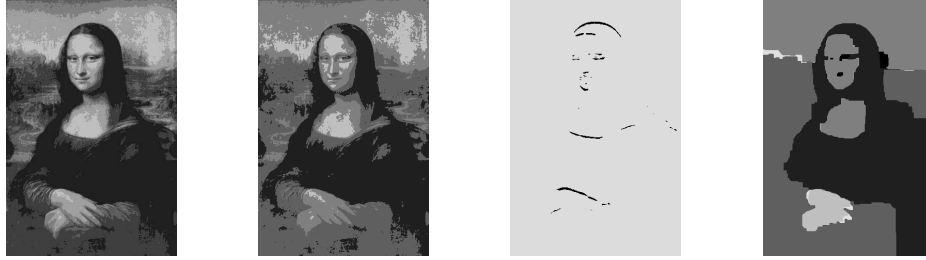
Figure 4. An example of image digitalization in 8 grey levels, with edges enforced, in the same spirit as in Figure 3. We consider 8 classes of grey levels. The individual potentials rely on the intensity of pixels. The coherency criterion makes use of an edge detector and enforces label variations on edges. From left to right : most probable grey level (at each pixel independently) of the original potentials; of the potentials once projected on the set of admissible potentials ( i.e. on \mathcal{F}_0 ); edges enforced; result. It is possible to let the user interact with the process and add edges manually to obtain new digitalization results. The interaction matrices used are (a) and (b) in Table 1.