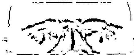
Figure 2: Projection of the extrema of the maximum curvature in the maximum curvature direction corresponding to the previous figure (the ratio defining the weighting point/normal in the least mean squares is about 1/40 )