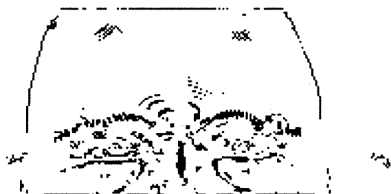
Figure 5: Projection of the extrema of the maximum curvature in the maximum curvature direction (the ratio defining the weighting point/normal in the least mean squares is about 1/5)

Then, we revisited the algorithm initially proposed by Sander and Zucker for locally estimating the curvature of a discrete 3-D surface, and we modified the original measurement equations and proposed an optimal estimation scheme to account for the previously computed uncertainties and corrections.