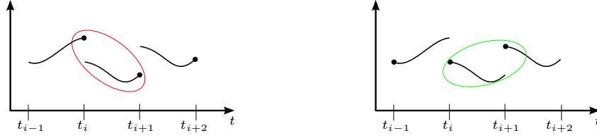
Figure 1: Piecewise smooth propagation with left and right discontinuity.

interval border. Piecewise constant functions and right interaction impulse discontinuity yield classic explicit (right velocity discontinuity) and implicit (left velocity discontinuity) timestepping schemes.