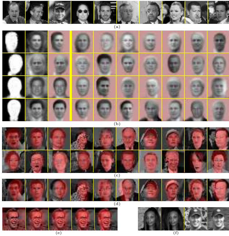
Fig. 2. (a) Examples of the training data. (b): Samples from the learned model. For the first three columns the format is similar to Fig. 1b, they demonstrate how shape ( \mathbf{m} , left) and appearance ( \mathbf{v}^F , middle) combine to the joint sample (right). The remaining columns show further samples from the model. For the joint samples the red area is not part of the object. (c): Inferred masks \mathbf{m} (foreground-background segmentations) for a subset of the test images. Masks are superimposed on the test images in red. In most cases the model has largely correctly identified the pixels belonging to the face. Test images for which the model tends to make mistakes typically show the head in extreme poses. Labeling of the neck and the shoulders is somewhat inconsistent, which is expected given that there is considerable variability in the training images and that the model has not been trained to either include or exclude such areas. The same applies if parts of a face are occluded, e.g. by a hat. (d) Test images with random masks superimposed. If masks are randomly assigned to test images the alignment of mask and image is considerably worse. Additional training images and segmentation results and a comparison with results for a conventional conditional random field can be found in the supplemental material [13]. (e): Convergence of the segmentation during learning (inferred mask \mathbf{m} superimposed on training image before joint training (left most) and after 10, 20, 100 and 1000 epochs of joint training). At the beginning the segmentation is driven primarily by the background model and thus very noisy. (f) Two examples of the pairs of images used for the recognition task.