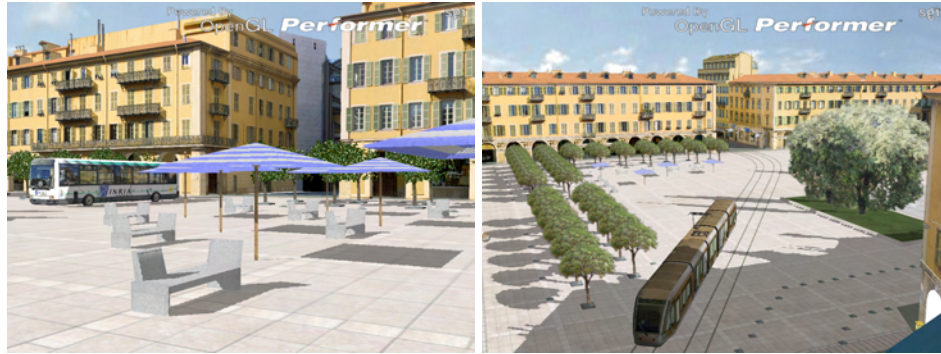
Figure 6: (Left) Simulator snapshot of the perspective view. Note the realism of the captured facades of the buildings, shadows and point-based rendering of trees. (Right) Balcony view of the Place Garibaldi, showing the Tramway passing through the square.

The user can manipulate dynamic elements in the scene, such as benches, umbrellas etc. in the top view, inspired by the iterative sketches process (Fig. 2). The user has the ability to freely switch between top, perspective and balcony view at any time and perform manipulations in all three.