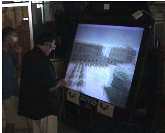
Figure 7: View of a user of the system on the workbench during the experiment (the screen shows the actual stereo display).

The experiment took place on a Barco Baron workbench 3 with the tracked game controller operating as described previously (Fig. 7). The participant was head-tracked and wore active stereo glasses.