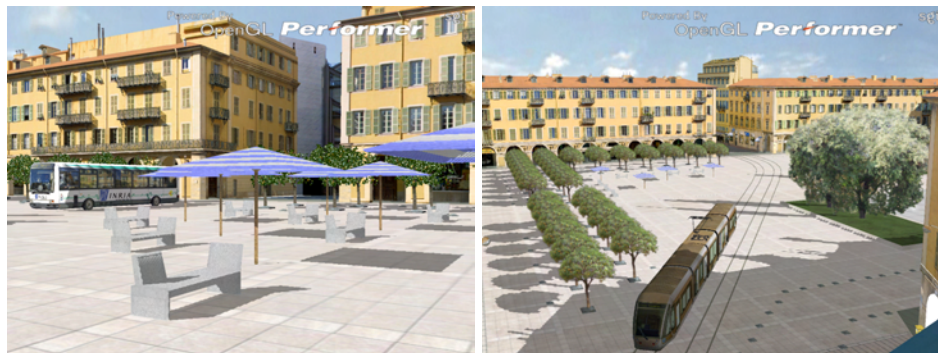
Figure 6: (Left) Simulator snapshot of the perspective view. Note the realism of the captured facades of the buildings, shadows and point-based rendering of trees. (Right) Balcony view of the Place Garibaldi, showing the Tramway passing through the square.

The user can manipulate dynamic elements in the scene, such as benches, umbrellas etc. in the top view, inspired by the iterative sketches process (Fig. 2). The user has the ability to freely switch between top, perspective and balcony view at any time and perform manipulations in all three.