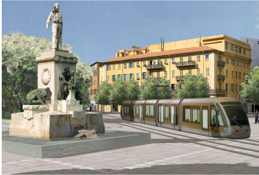
Figure 1: The Virtual Environment of Place Garibaldi in Nice, France, constructed for the study of a future Tramway project.

In the first case, the challenge has been to visualize large data sets in as photorealistic a fashion as possible. These environments are mostly used for presentation, recreation, and educational purposes (e.g. review of architecture before it is actually built, cultural heritage reconstructions, 3D entertainment rides, etc.) where complex 3D spaces are constructed so they can be explored in walkthroughs (Brooks, 1986; Houston, Niederauer, Agrawala, & Humphreys, 2004). The majority of these projects allow for little to no interactivity beyond the user's ability to freely navigate about the environment.