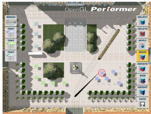
Figure 5: The top view of the VE is displayed with two sets of menus for the insertion and manipulation of dynamic objects. An element (shown with the small circle) is attached to the end of the rod and can be moved and positioned freely.

The user can manipulate dynamic elements in the scene, such as benches, umbrellas etc. in the top view, inspired by the iterative sketches process (Fig. 2). The user has the ability to freely switch between top, perspective and balcony view at any time and perform manipulations in all three.