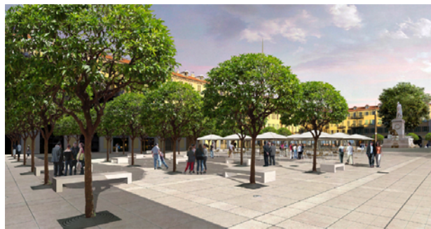
Figure 4: Detailed photo-montages are used to present the project to decision makers.

The next stage is the production of photo-montages which are shown to the decision makers and elected officials (Fig. 4). These montages are used to achieve agreement by the different parties and, after this process, the overall “look and feel” of the design converges (i.e., the overall “stone look” of the square, the fact that the trees and the statues are maintained, etc.).