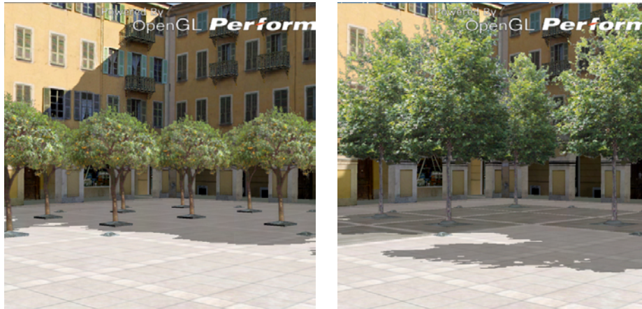
Figure 8: Snapshots of the different solutions for Place Garibaldi, used in the City Hall meeting and the brainstorming session with the architects. Left, the “orange tree” solution; right, the “oak tree” solution. Note how shadow coverage is very different in each.

The working group involved a total of ten persons, mainly high-ranking city officials in charge of public spaces and urban planning, and the architects in charge of the overall project.