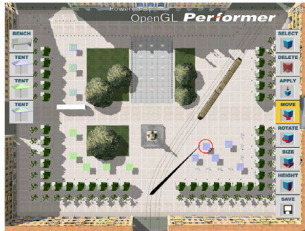
Figure 5: The top view of the VE is displayed with two sets of menus for the insertion and manipulation of dynamic objects. An element (shown with the small circle) is attached to the end of the rod and can be moved and positioned freely.

The user can manipulate dynamic elements in the scene, such as benches, umbrellas etc. in the top view, inspired by the iterative sketches process (Fig. 2). The user has the ability to freely switch between top, perspective and balcony view at any time and perform manipulations in all three.