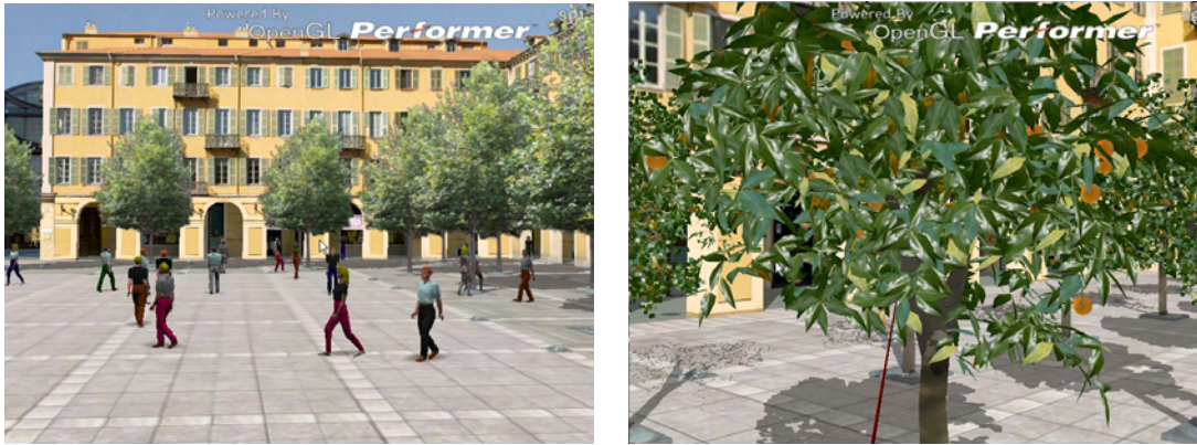
Figure 10: Left: an example with crowds in the Square. Right: Mixed point-based/polygon trees.