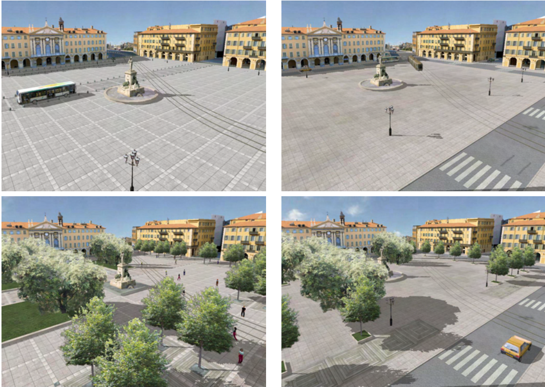
Figure 9: Screenshots of the 4 scenarios used during the presentation to officials.

various options for the square, concerning the questions of vegetation and the presence or absence of cars.