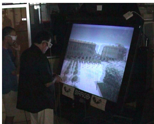
Figure 7: View of a user of the system on the workbench during the experiment (the screen shows the actual stereo display).

The experiment took place on a Barco Baron workbench 3 with the tracked game controller operating as described previously (Fig. 7). The participant was head-tracked and wore active stereo glasses.