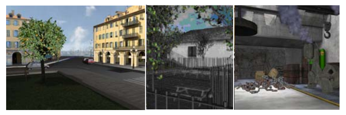
Figure 1. The three virtual environments used in this study. On the left, the city scene, in the middle, the garden scene, and on the right, the factory scene.

We use exterior and interior virtual scenes. The two exterior scenes are a street scene (see Figure 1), with cars passing by and traffic noise; and a garden scene with trees, a house, tables and benches. The interior scene is a large dark hangar, in which different industrial machinery are active and producing contact sounds.