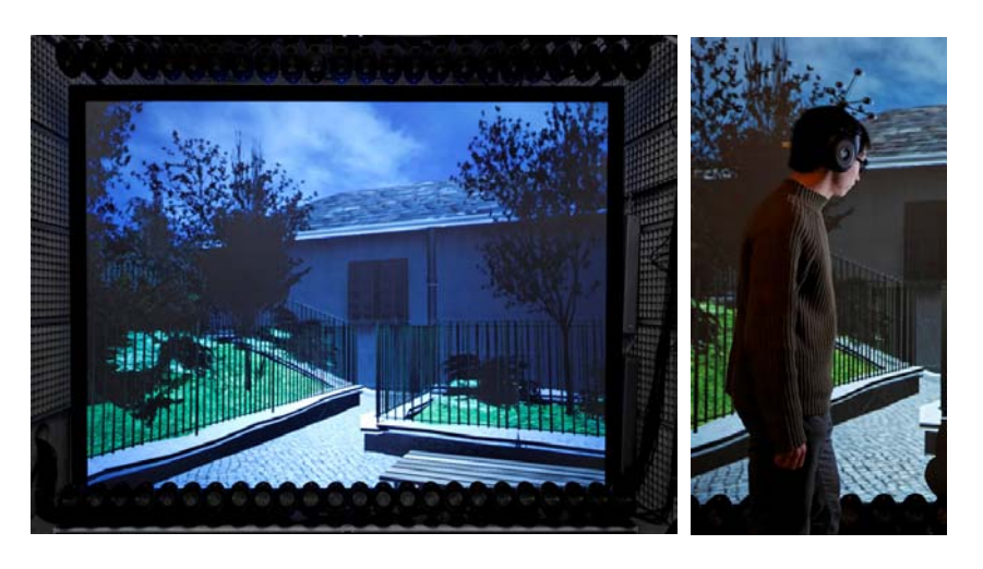
Figure 2. Virtual Reality setup. On the left, view of the entire screen in the acoustically damped studio, on the right, a participants equipped with headphones, a head tracker and polarized glasses.

The sessions take place in an acoustically damped and sound proof recording studio with the light switched off. The visual scenes are presented on a 300\times225~\text{cm}^2 stereoscopic passive screen, corresponding to 90\times74 degs at the viewing distance of 1.5 m, and are projected with two F2 SXGA+ ProjectionDesign projectors. Participants wear polarized glasses.