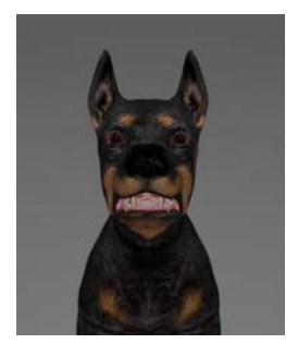
Figure 4. The Doberman dog model, which was selected as the dog to be included in the exposure sessions.

The Doberman was therefore selected as the threatening stimulus for the exposure sessions. Several animations have been developed: running, walking, seating, jumping etc. It also affords growling as well as barking, and the experimenter can control the dog animations with keys. The dog's barking and growling are spatialised in 3D.