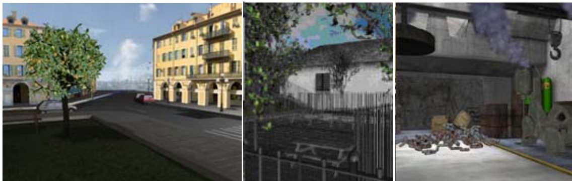
Figure 1. The three virtual environments used in this study. On the left, the city scene, in the middle, the garden scene, and on the right, the factory scene.

We use exterior and interior virtual scenes. The two exterior scenes are a street scene (see Figure 1), with cars passing by and traffic noise; and a garden scene with trees, a house, tables and benches. The interior scene is a large dark hangar, in which different industrial machinery are active and producing contact sounds.