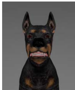
Figure 4. The Doberman dog model, which was selected as the dog to be included in the exposure sessions.

The Doberman was therefore selected as the threatening stimulus for the exposure sessions. Several animations have been developed: running, walking, seating, jumping etc. It also affords growling as well as barking, and the experimenter can control the dog animations with keys. The dog's barking and growling are spatialised in 3D.