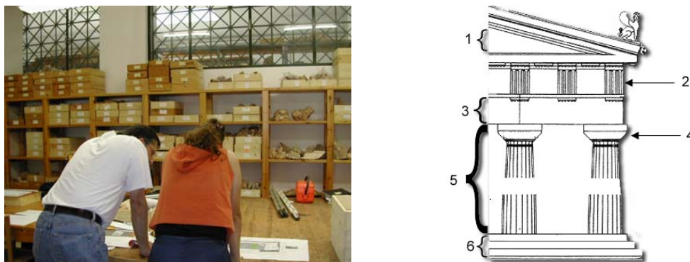
Figure 1: Working with archaeologists to define the virtual reconstruction task (left). Cross section of a temple, indicating the different members that the user manipulates in the VE (right).

The second case study concerns the archaeological site of ancient Messene in Greece, specifically the study of the excavated Doric temple of the site. The temple is preserved in poor state, but there are a considerable number of architectural members found in the adjacent area, all of them well documented and interpreted by the Society for Messenian Studies, the archaeologists responsible for the excavation of the site.