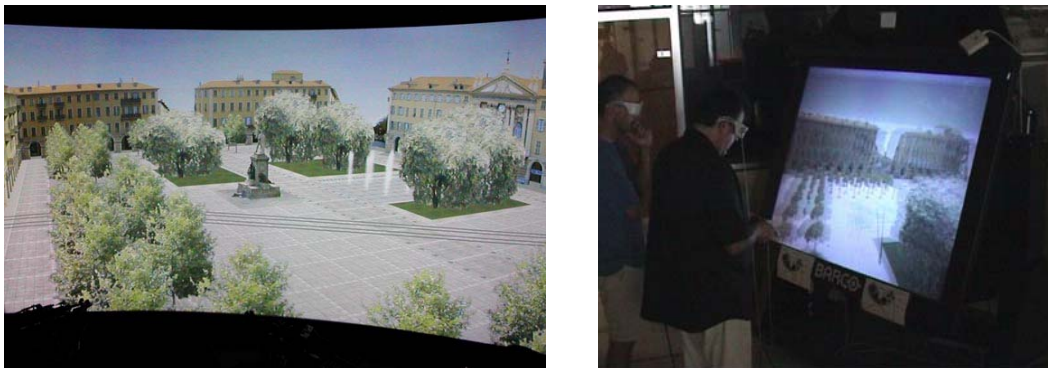
Figure 2: View of the urban planning VE on a curved presentation display (left) and an architect using it on an immersive workbench (right).

The user needs analysis was carried out at the very beginning of the project and led to the definition of the user task scenarios that were used in the evaluation sessions. Usability evaluation forms a central tenet of our evaluation methodology, as it involves observing the users of the VE in order to determine if the VE aids or hinders them in reaching their intended goals. Given the nature of our project, we chose to limit our testing to a small number of users and follow an in-depth qualitative approach. One of the reasons for this is the obvious practical difficulty in evaluations within real-world situations, i.e., getting busy, highly qualified professionals to agree in participating in experimentation, which requires a significant investment in time. Other reasons include the highly experimental nature of the prototypes and the use of innovative and relatively inaccessible equipment (tracked immersive VR displays). We believe that for this project, case studies, where small groups of users are studied in depth, are more useful for gaining insights into the effectiveness and efficiency of our system, and come as a natural continuation to the design process that preceded the evaluation.