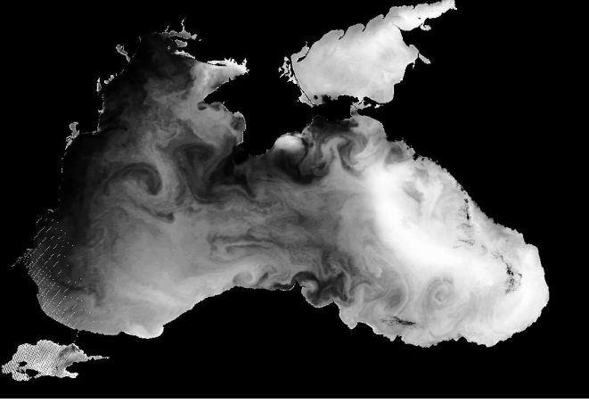
Fig. 1. SST image of the Black Sea given by NOAA/AVHRR.

has been extensively studied [5, 6, 7, 8, 9, 10, 11, 12, 13]. The classical computer vision approach relies on a dense estimation of the displacement velocity based on the so-called conservation of gray level-value assumption (also called optical flow constraint): given a pixel (x(t), y(t)) on an image I at time t , we have: