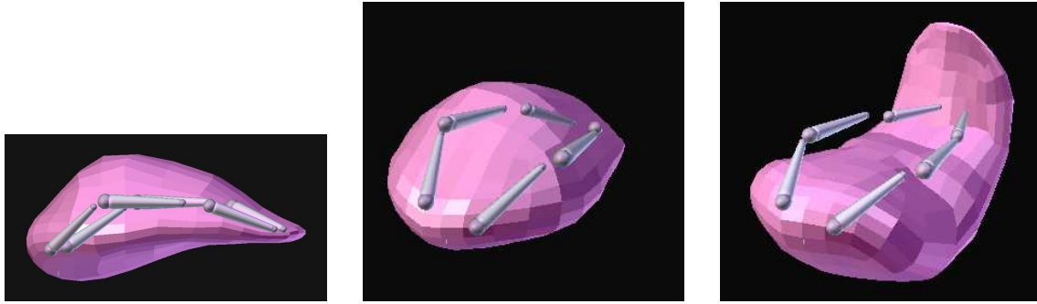
Figure 2. Side view (slightly oblique) of tongue mesh (tip on right) and armature, superimposed as six stick-like shapes, and two deformations of the mesh (tongue back towards the viewer) obtained by manipulating the armature. The center and right panels show a bunched and retroflex configuration of the tongue model, respectively.

vertices, and this association can furthermore be weighted either individually or by vertex groups. Hence, the movement and rotation of each EMA coil can be transferred to the vertices, thereby animating the tongue mesh. This can be described as a form of the skeletal animation technique.