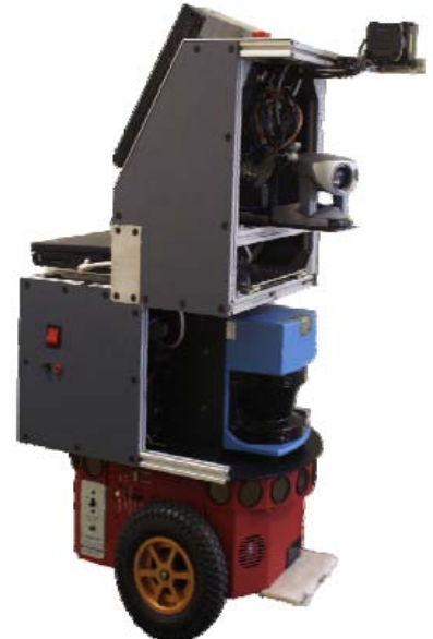
Figure 1: The modified Pioneer P3-DX robot used for the CAROTTE competition.

2D SLAM is performed using the horizontal laser scanner and the Karto software library 2 , which provides good performances and robustness in indoor environments. This library uses