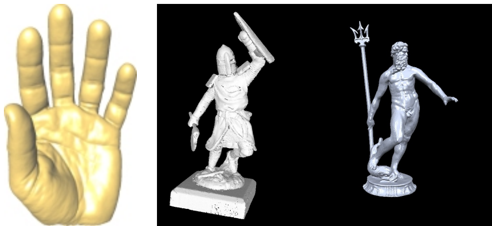
Figure 3: Scanned models (from Aim@Shape repository).

The “Random disks” point sets have also been generated in dimension three with similar constraints.