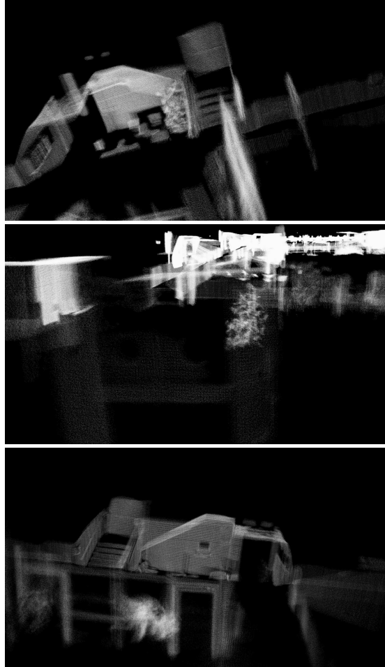
Figure 2: Detailed views of the map.