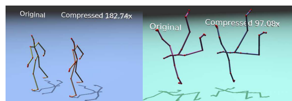
Figure 1: Sample compressed animations

linear multiresolution analysis such as [RDS*05], as well as non-linear statistical descriptive analysis, namely Principal Geodesic Analysis (PGA, [FLJ03]). PGA is an extension of PCA to the case of data lying in certain curved manifolds, such as orientation space SO(3) . The data are projected onto geodesics instead of straight lines, so that no deviation from the manifold occurs during the process.