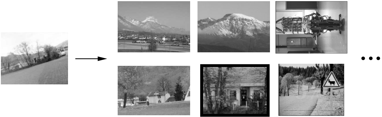
Figure 1: Image retrieval in the presence of image rotation and a scale factor of 4.9. The image database contains more than 5000 images. On the left the query image and on the right a few images of the database. The corresponding image is correctly retrieved (second image on the bottom row).

method is based on a repeatable and discriminant point detector. This detector is based on two results on scale space: 1) Interest points can be adapted to scale and give repeatable results [1]. 2) Local extrema over scale of normalized derivatives indicate the presence of characteristic local structures [2]. The first step of our approach is to compute interest points at several scale levels. We then select points at which a local measure (the Laplacian) is maximal over scales. This allows to select a subset of the points computed in scale space. For these points we know their scale of computation, that is their characteristic scale. Points are invariant to scale, rotation and translation as well as robust to illumination changes and limited changes of viewpoint.