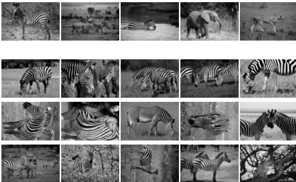
Figure 4: Retrieval results. The top row shows a subset of the training images (3 positive and 2 negative examples). The other rows show the first 15 retrieved images ordered by their score (from left to right and from top to bottom).

“texture-like” visual structure ; our learning algorithm is unsupervised and therefore does not require manual extraction of objects or features. It allows to learn an appropriate representation of the model. We are currently investigating five extensions. The first is to add scale selection to the model construction. The second is to learn which components of our multi-valued descriptors are significant. The third is to improve the clustering algorithm and to automatically select the number of clusters. The fourth is to include global constraints, for example by modelling relations between parts. The fifth extension is to improve the model over time by user interaction.