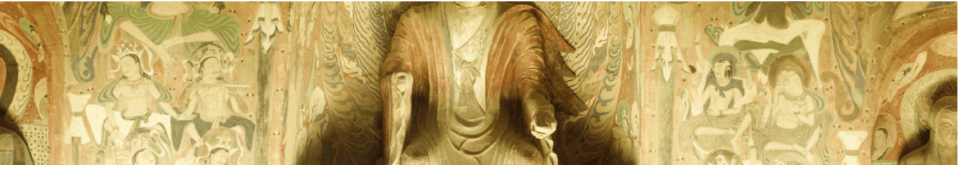
Figure 2. A static relief mosaic at 3700 \times 840 composed from six images at 1004 \times 752 .

The function s(\mathbf{u}, \mathbf{u}') should guarantee a smooth transition for the whole composite image, one possible choice might be