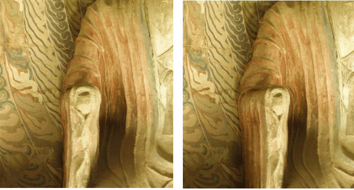
Figure 4. Local parallax changes rendered at 500 \times 545 resolution from the relief mosaic in Figure 2.

Plenoptic modeling using relief mosaics Only local parallax changes can be rendered with a single relief mosaic. However relief mosaics can be used as building blocks for more general plenoptic modeling of larger environments. This gives a more powerful representation than plenoptic modeling [9] and a more space/construction efficient one than Lightfield/Lumigraph [5, 3] and concentric mosaics [16]. We have implemented a sparse horizontal Lightfield system for outward looking scenes.