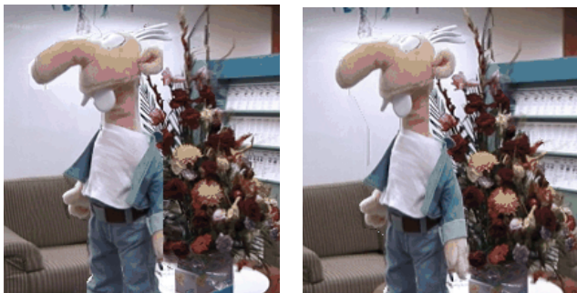
Figure 6. Local parallax changes rendered at 210 \times 220 resolution from the relief mosaic in Figure 7.

The office scene was taken by a single camera moving off-line along a circle. The panorama can not be composed using traditional mosaic registration techniques due to its strong motion parallax. The relief mosaic at 3577 \times 288 resolution shown in Figure 7 was created from 36 video images at 360 \times 288 resolution. The significant parallax between adjacent images shown in Figure 1 (the maximum disparity can reach 1/10 of the image size) makes composition impossible with traditional mosaicing methods. Local parallax changes rendered with this relief mosaic are shown in Figure 6.