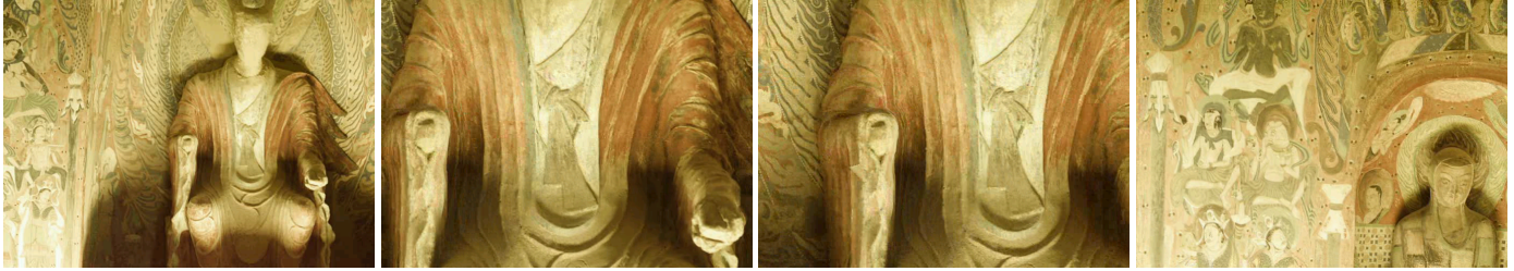
Figure 8. Synthesized images at 700 \times 500 resolution from the field of 36 images at 1004 \times 752 resolution. We may notice that a triangular patch is mis-placed in the front arm in the third view.

captured with a hand-held camera. This has been demonstrated with our system on an example with only 6 \times 6 images. We are currently extending it to produce a more general (real) image based modeling and rendering system.