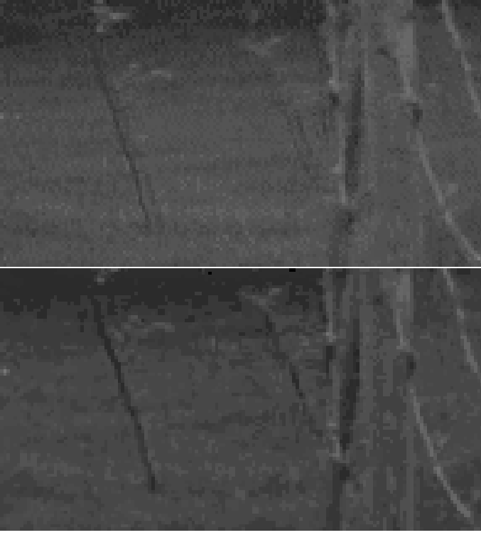
Figure 3. A close-up zoom of a typical traditional mosaic from a hand-held camera. (top) a cylindrical mosaic by a global alignment method; (bottom) a mosaic by relief compositing method. The mosaic on the top is often ghosted due to the parallax of the foreground tree from non-negligible camera motion. The ghosting artifacts are removed using local warping for registration in the relief mosaic.