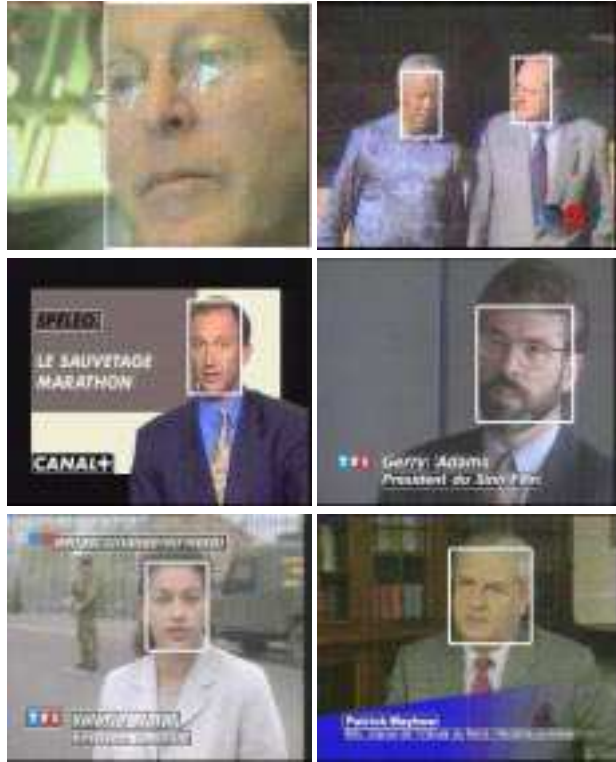
Figure2. Some results of face and text detection.

and size of detected faces may characterize a big audience (multiple faces), an interview (two medium size faces) or a close-up view of a speaker (a large size face). Location and size of text areas helps in characterizing the video content especially in news. In this section, we explain in more details how such shot classes can be defined, and their instances recognized automatically, in a DL framework.