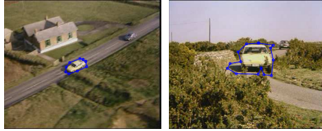
Figure 1: Two shots with similar tracked objects (yellow car) and different backgrounds

The similarity between shots should not be necessary limited to the global color distribution. Two shots of the same scene may have very close contents like detected persons and very far global color distributions due to partial changes/occlusions in the decor of the scene. Figure 1 illustrates an example of two successive shots (represented by their middle images), of the same video scene, which have very close tracked objects (the yellow car) and totally different image backgrounds.