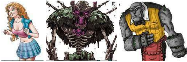
Fig. 2. Examples of Urban Rivals characters. Characters have different abilities: strong attack (better probability of winning the turn); better strength (more damages in case of won turn). The crucial points is how many “pilz” you use per turn: “more pilz” implies a better probability of winning; the key point is that the choice is the number of pilz is made privately until the end of the turn. At the end of each turn all the hidden information is revealed.