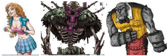
Fig. 2. Examples of Urban Rivals characters. Characters have different abilities: strong attack (better probability of winning the turn); better strength (more damages in case of won turn). The crucial points is how many “pilz” you use per turn: “more pilz” implies a better probability of winning; the key point is that the choice is the number of pilz is made privately until the end of the turn. At the end of each turn all the hidden information is revealed.